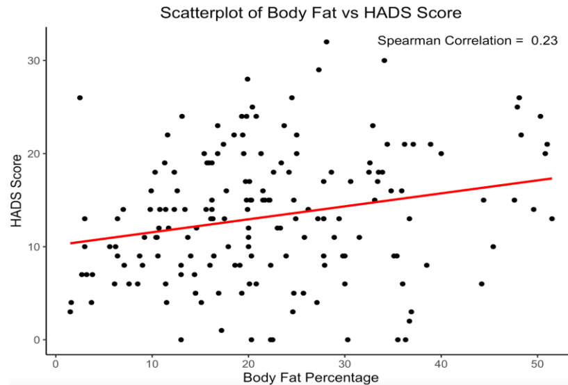
Figure 2. Correlation between body fat percentage and HADS score. Note. N = 175. Every percentage increase in body fat correlations with an average HADS score increase of 0.14 ( p = 0.01 ).